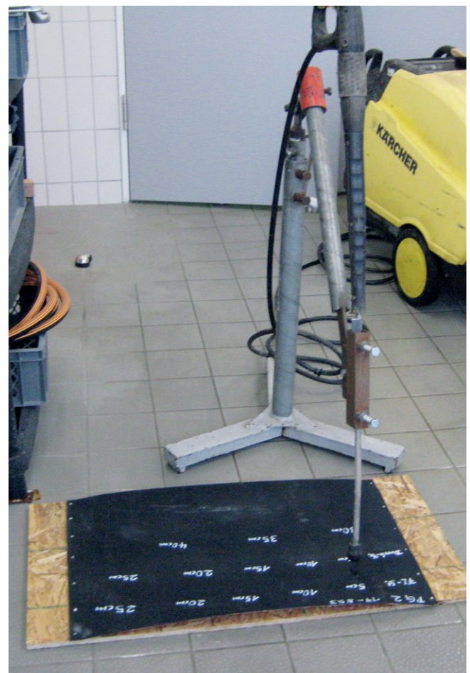
Figure 4: Cleaning distance measurement