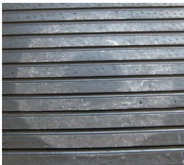
Figure 5: Underside of the mat – after permanent tread load test