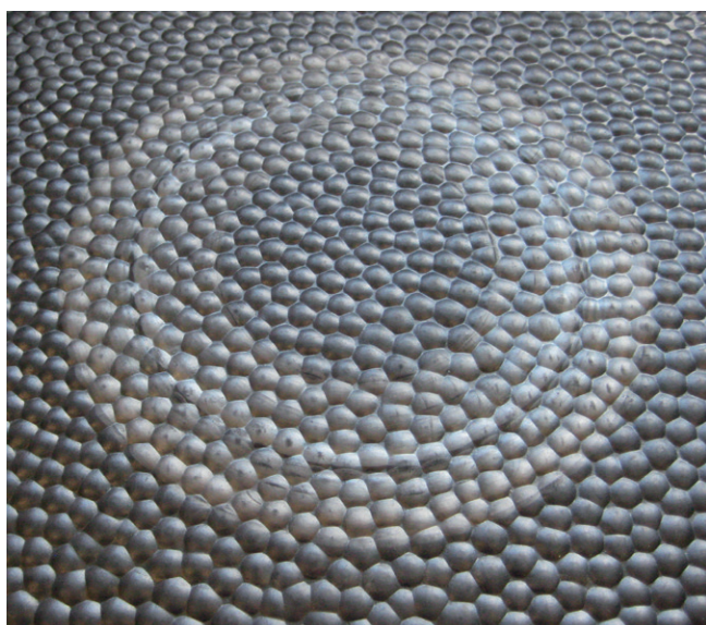
Figure 4: Surface of the mat – after permanent tread load test