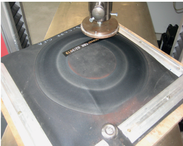
Figure 3: Deformation measurement

No noticeable wear was observed following exposure to permanent tread load on a test stand with 100,000 alternating loads at 10,000 N. No lasting deformation was observed.